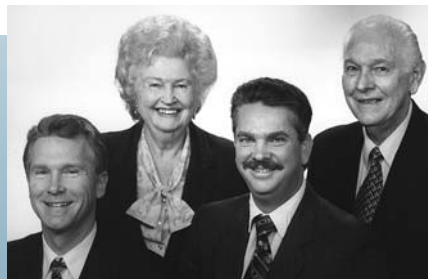
Family Owned and Operated Since 1924

"Best Furniture Store" as voted by readers of Glendale News Press and Foothill Leader